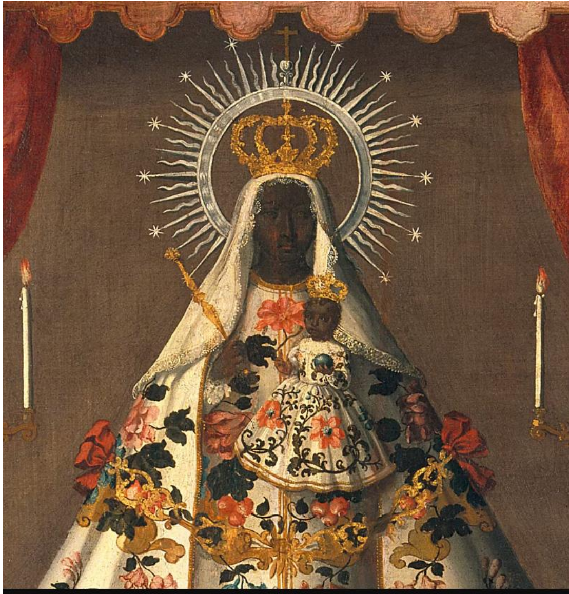
BLACK VIRGIN: (VIRGINIS PARTITURAE), the Virgin who must be turned into a Mother.

THE CHRIST : Principle that cannot, in any way, be anthropomorphized, but must always be considered as a "PSYCHOLOGICAL PROTOTYPE OF PERFECTION".